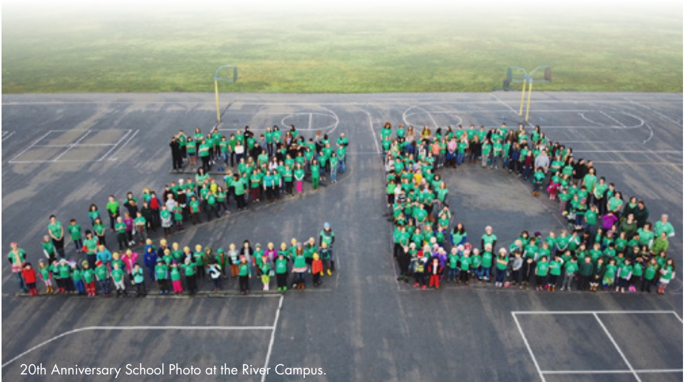
20th Anniversary School Photo at the River Campus.

As we have grown and evolved, our committed community has succeeded by working together with creativity and compassion to make the most of any situation. Our resilience stems from our clarity of purpose – to prepare students to engage in a dynamic world. We are not strangers to change, and we look forward to continuing to learn and adapt our strategies while staying true to our principles as schools inspired by Waldorf education.