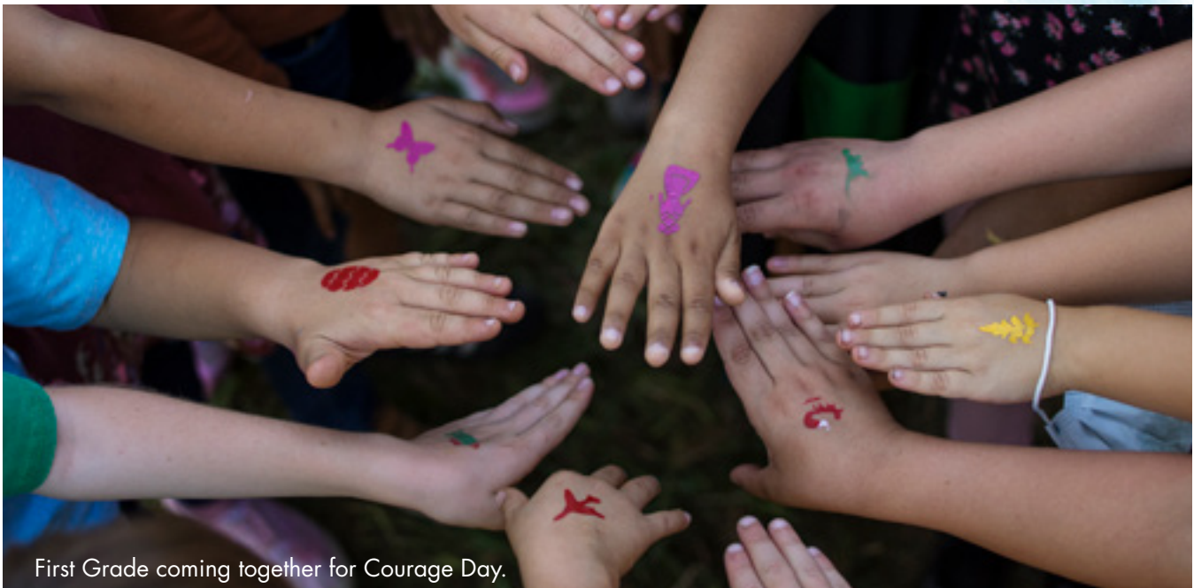
First Grade coming together for Courage Day.

We leveraged a professional Strategic Management methodology to co-create our plan systematically and holistically. We surveyed the community and hosted Community Open Forums to get broad input on the elements of the plan and what is important to our community.